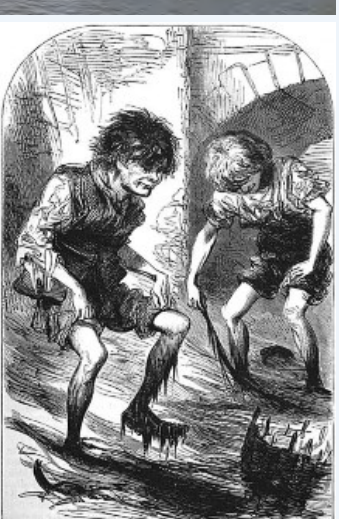
Mudlarks of Victorian London from The Headington Magazine, 1871

Unlike many other capital cities, London's river is tidal so its foreshore is exposed at low tide. A mudlark is someone who scavenges in river mud for treasure, making it a common occupation amongst the poor of London in the eighteenth and nineteenth centuries. Today there has been a renewal of interest in mudlarking, but on The Thames it is now carefully controlled by the Port of London Authority, which issues 'mudlarking permits' to accredited persons to explore the beach for archaeological objects.