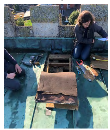
Copper stripped back from chancel roof (plus one of our architects)

We also opened up a small section of the chancel roof in September to investigate the state of repair of the boarding underneath. With the roof copper