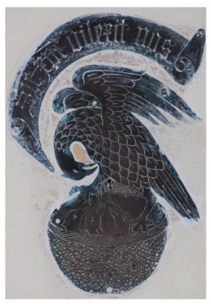
Pelican in piety engraved in 1901 from the brass of a priest in mass vestments, dated c.1430.