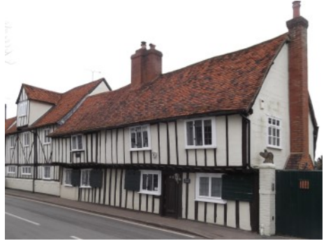
Manuden Old Maltings