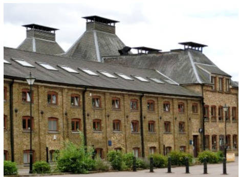
Stanstead Abbots Maltings