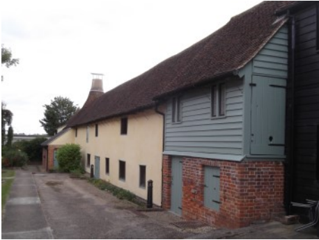
Great Dunmow Maltings

growth was halted at a particular stage by applying heat in the kiln at the other end of the building. The process of initiating and then halting germination is known as malting .