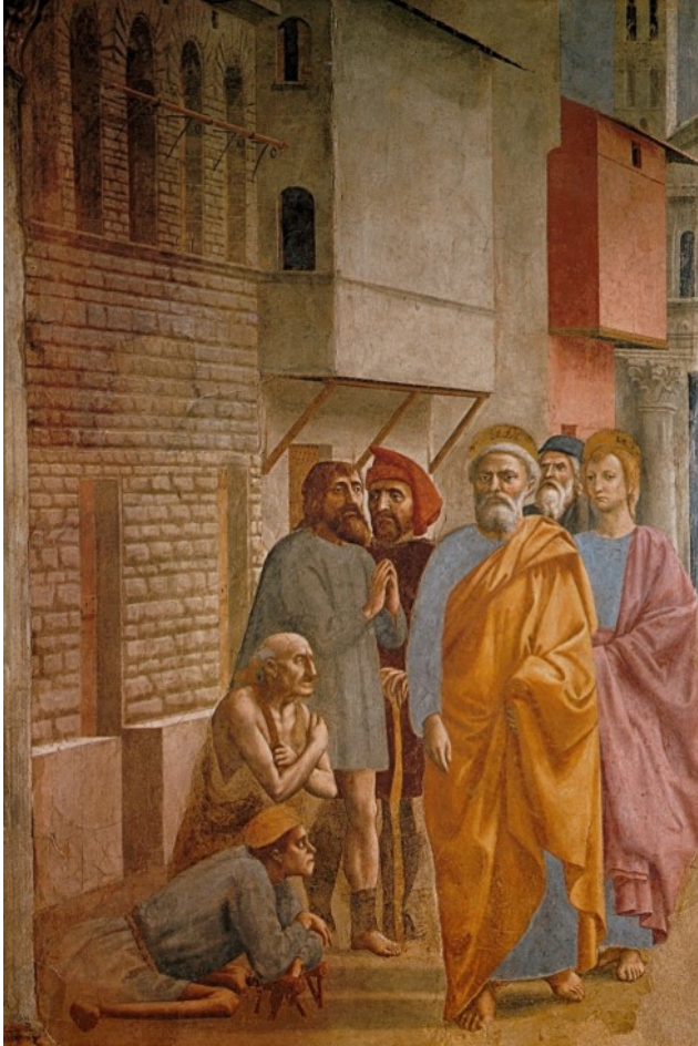
Saint Peter Healing the Sick with His Shadow, by Italian artist Tommaso Cassai Masaccio (1425-26)