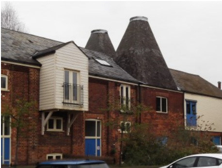
Newport Station Maltings