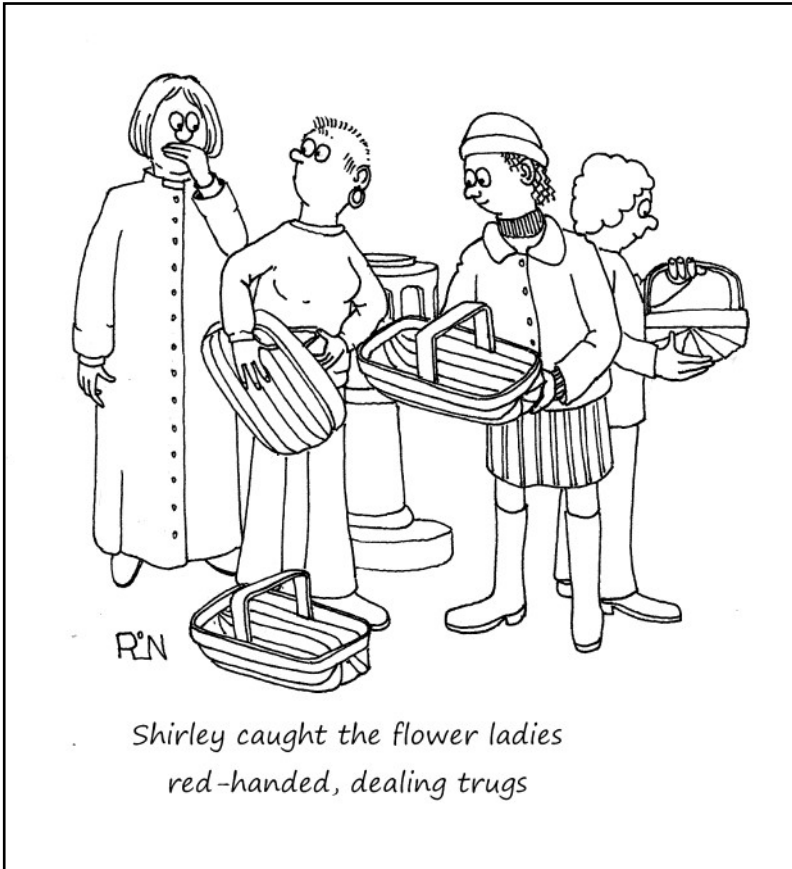
Shirley caught the flower ladies red-handed, dealing trugs