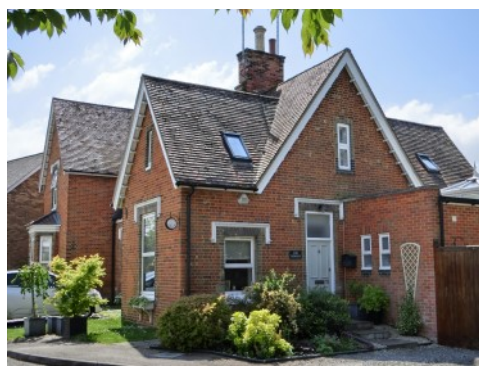
Buntingford's former station