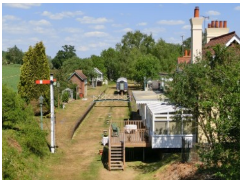
Braughing Station, the Buntingford Line