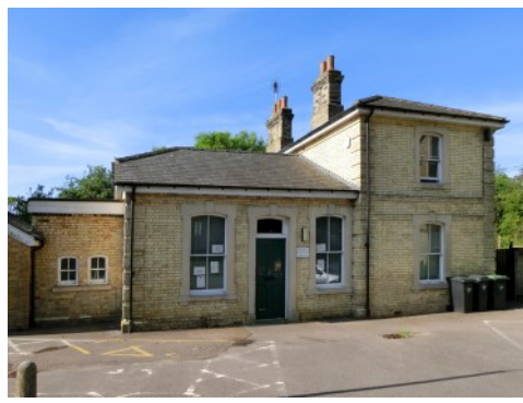
Takeley Station on the Flich Way