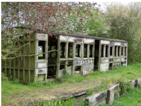
Ashdon Halt on the Saffron Walden line