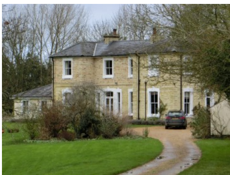
Bartlow's former station