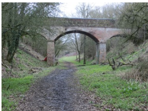
Dunmow Cutting on the Flich Way